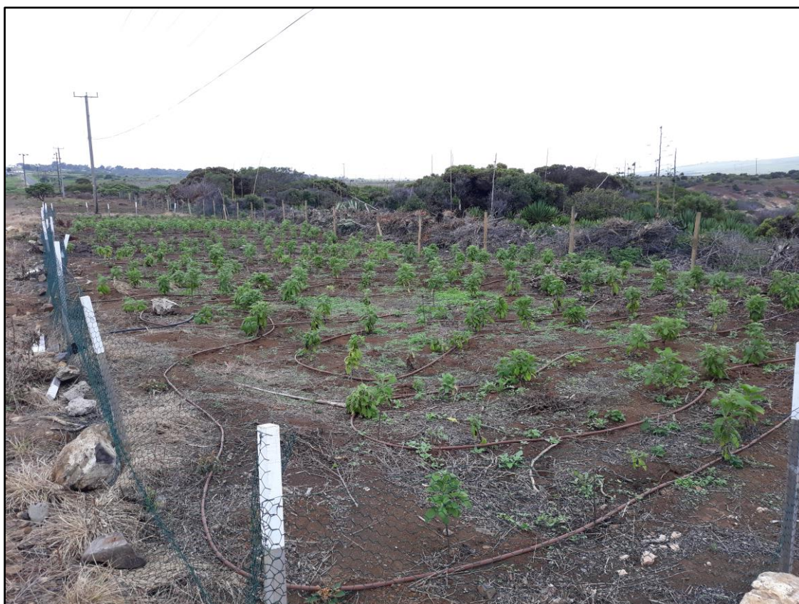
Figure 4: Native plants planted into cleared area (fenced and irrigation installed)

The project delivered on value for money by not purchasing any capital equipment but instead capitalising on equipment that was already present at the Millennium Forest. The project team was led by experienced senior staff (project leader and manager and Millennium Forest nursery manager) who trained the three new conservation assistant staff in perfected propagation techniques and maintenance around the Forest i.e. irrigation maintenance and repair.