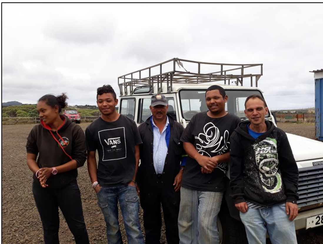
Figure 2: Project team and Apprentice